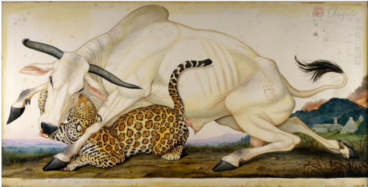
Fig. 1: Walton Ford, Chingado , 1998 Watercolor, gouache, pencil, and ink on paper. 152.4 x 302.3 cm © VBK, Vienna 2013

Walton Ford's watercolor painting Chingado (1998) elicited a most memorable reader response when presented in the online edition of Germany's respectable weekly newspaper Die Zeit . In a rather minimalist account for the painting's strange subject matter and title, the anonymous author of the 2010 article explained: "An American jaguar driving its teeth into the throat of the Indian zebu cattle. 'Chingado' is Spanish and means as much as fucker ." 1 Quick to sense a basic deficit in this introduction, the first online commentary pointed out the "strange coitus" named –and 'depicted'– in Chingado : "Whoever may be presenting the pictures here has not had a close look at them". 2 More unsettling than the jaguar's virtually lethal grasp of the zebu bull is indeed the dominant position of the latter, violently copulating